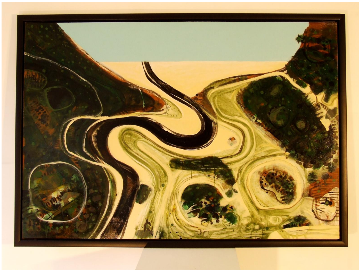
'SOMETIMES WHEN YOU HAVE YOUR FACE IN THE SAND' Acrylic on Board Framed W: 180cm H: 120cm D: 2.5cm $4200.00