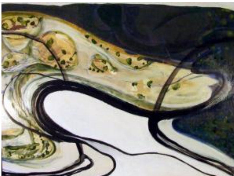
'LEFT-OVER SEGUE TO IDEAS'

Acrylic on Board Framed W: 120cm H: 90cm D: 2.5cm $2500.00