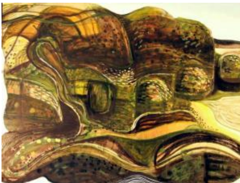
'HOW CLEAN AND GREEN THEY ARE'

Acrylic on Board Framed W: 120cm H: 90cm D: 2.5cm $2500.00